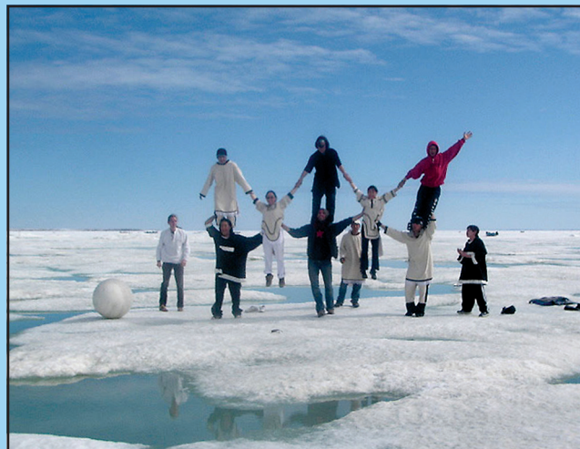
Artcirq perform the “Trampoline” at Igloolik Point, 2005.

As remote as this small island may be, Igloolik is an active and popular place. Today it proudly boasts the Igloolik Research Centre, commonly known as “the mushroom.” As part of the polar continental-shelf research