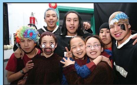
Igloolik children in performance standby, 2006.