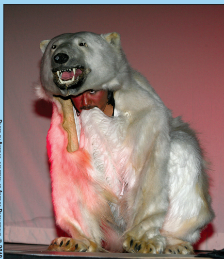
Artcirq performance of the "Polar Bear" at the Alianait Festival, 2007.

Invited by Inuusiq , six performers from the National Circus School of Montreal