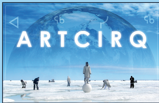
ARTCIRQ promotional poster.

Over the course of these three weeks, Inuusiq brought the Montrealers together with young Inuit and elders from Igloolik for an expedition across Baffin Island, the purpose of which was to present its show and share its message with local youth in other communities. During this journey, the young expedition members learned more about their own land, were exposed to traditional Inuit ways of life, and even explored Baffin Island's east coast.